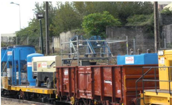
Image 1: One of two worktrains in Portugal

The company Brawmingen has got the contract for cleaning 22,000 square metres on six railroad tunnels in Portugal. Two worktrains with six torbo machines are doing this job each day from midnight to 5 o'clock in the morning.