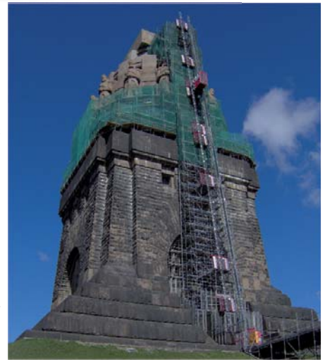
Image 3: Völkerschlachtdenkmal („Monument to the battle of the nations“)

The construction required a total of 120,000 m 3 of tamped concrete and 12,500 m 3 porphyroid granite. The monument was inaugurated in 1913 on the occasion of the 100th anniversary of the decisive battle of the Allied Forces against Napoleon`s army. Over 120,000 people paid for this battle with her life. The imposing 90-metre-high-monument got over the first and second world war.