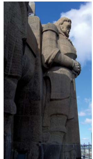
Image 5: 12,5m high outside stature

A number of sand blasting systems were tested in advance. The decision was ultimately in favour of torbo. There won`t be any losers when it comes to the restoration of the „Völkerschlachtdenkmal“ in Leipzig. The winners include not only the new (old) monument and the people of Leipzig, but also all fans of historic architecture.